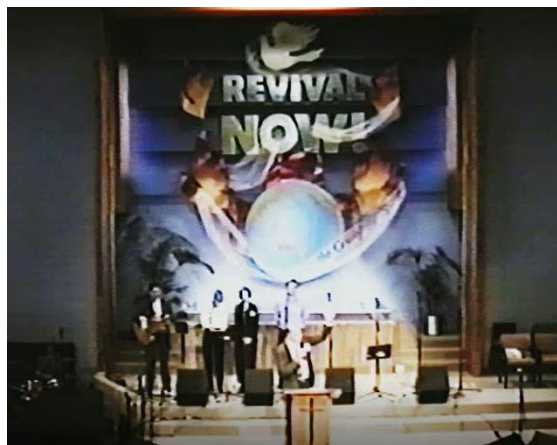
Dr David Cartledge and Ps Wayne Hughes, "Revival Now!" Digitised October 25, 2018.

It has been a great privilege to have funds in the 2019 budget allocated to storage equipment for our archival collection. Our collection has outgrown the parameters of the archive room and the implementation of a new compactus unit along with a map plan cabinet will ensure that more of our collection can be accommodated. Extra shelving space will free up room to encourage the continued growth of and organisation of the collection. This process will also provide momentum for the assignment of more specific collection names and groupings within larger sections of the collection – a process that will facilitate research in more specific areas and accommodate the collection's growth in organisational terms.